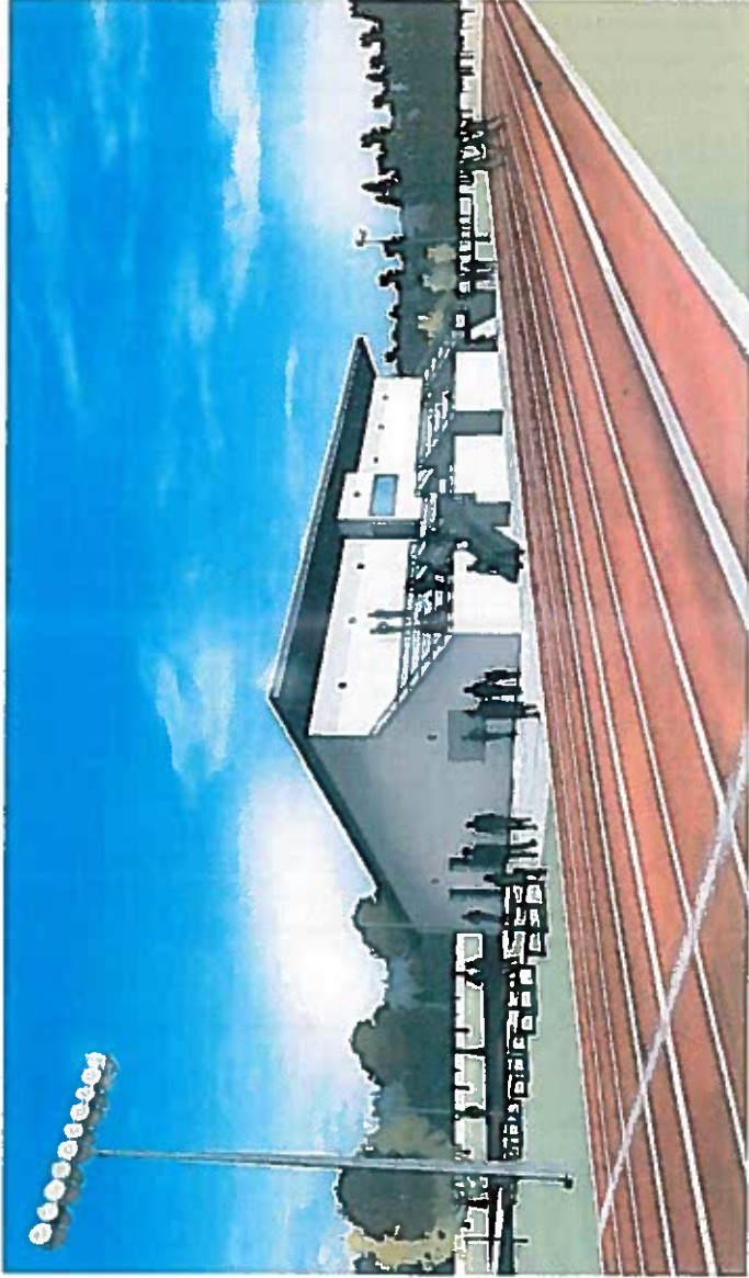
COMMUNITY LEARNING CAMPUS – Running Track/Bleachers/Viewing